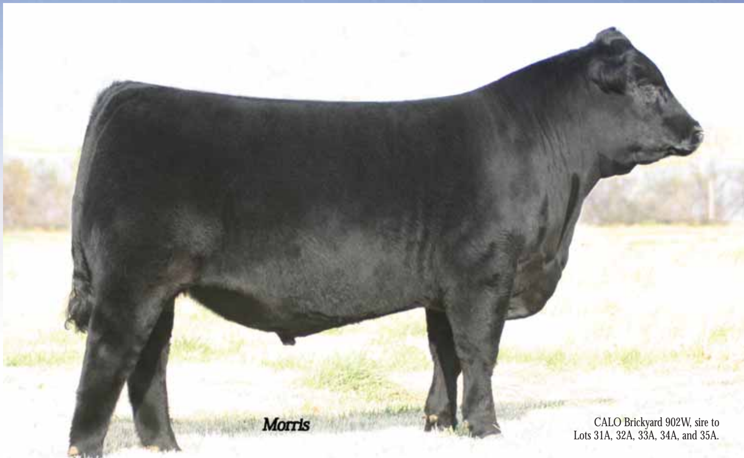
CALO Brickyard 902W, sire to Lots 31A, 32A, 33A, 34A, and 35A.