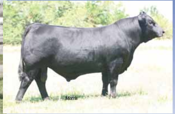
EBFL Ypsilanti 420Y, sire of Lot 4