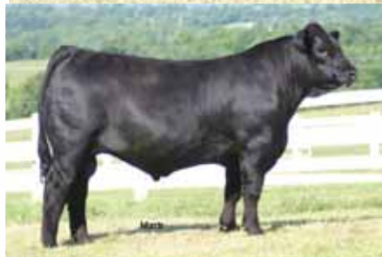
MAGS Willpower, sire of Lot 52 & 53.