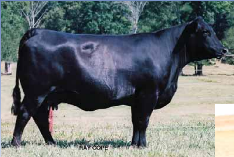
EXLR Scotch Cap 1005N, dam of Lot 12