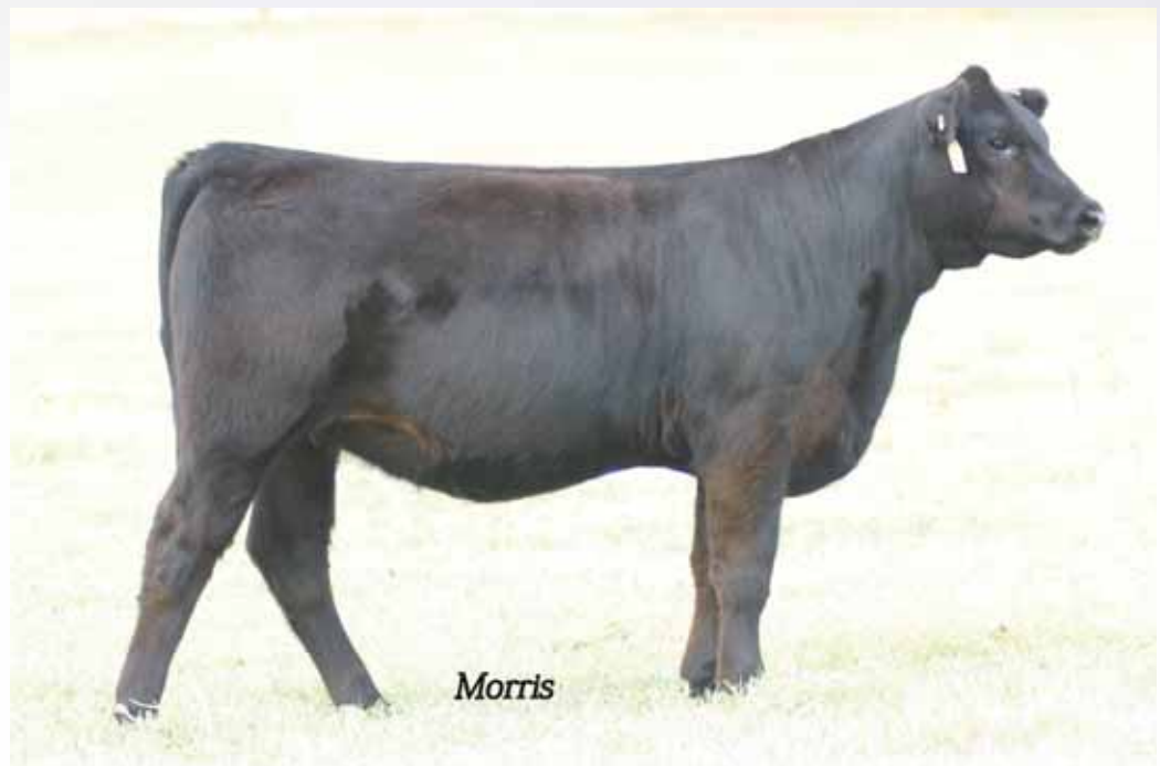
STSF Yesterday 174Y, Lot 46