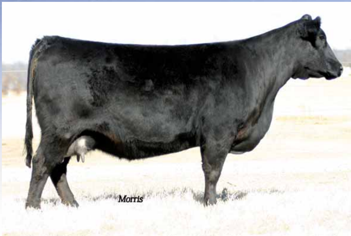
MAGS Timeless, dam of Lot 2 and 3.

IMF and still maintained a 12.8 for REA. This homozygous polled, homozygous black 50% Lim-Flex donor is sired by the proven and popular AUTO Dollar General 122R and from the Twin Eagles Pride 405P donor. This young donor has a picture perfect profile and is a model of a Lim-Flex female. She is extremely deep bodied, big boned, soft in her pasterns and extremely feminine up through her front end. Salt Creek Cattle Co. is highlighting this sale with her two embryo heifers. One is sired by the breed leading EBFL Ypsilanti 420Y and one sired by the past Lim-Flex national champion CALO Brickyard 902W. Buy with confidence when selecting genetics from this breed leading donor, MAGS Timeless.