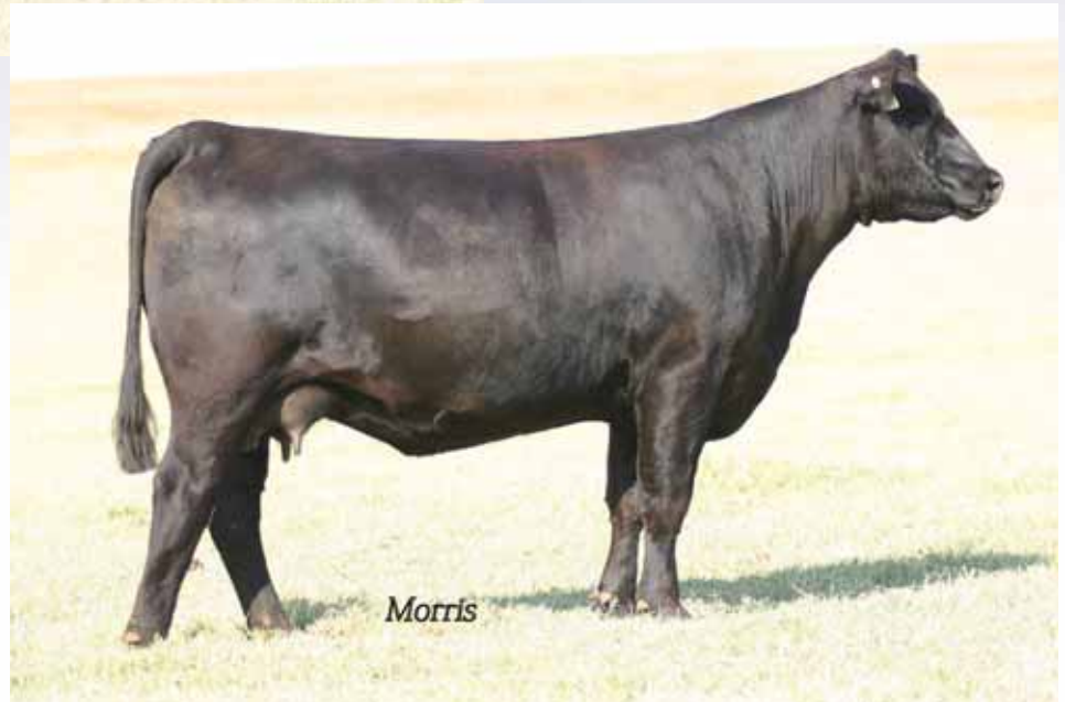
HCC 5682 Georgina 0244, Lot 33