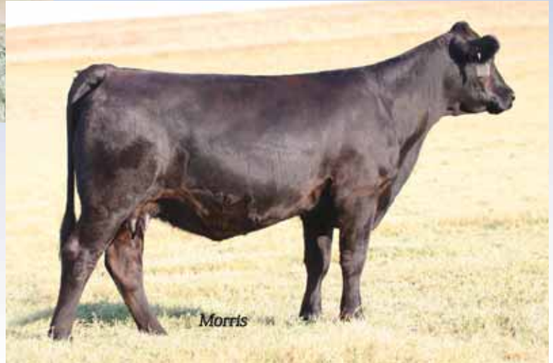
DL X-Otic 505X, Lot 13