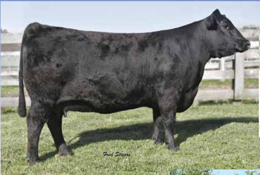
MAGS Personal Best, dam of Lot 4