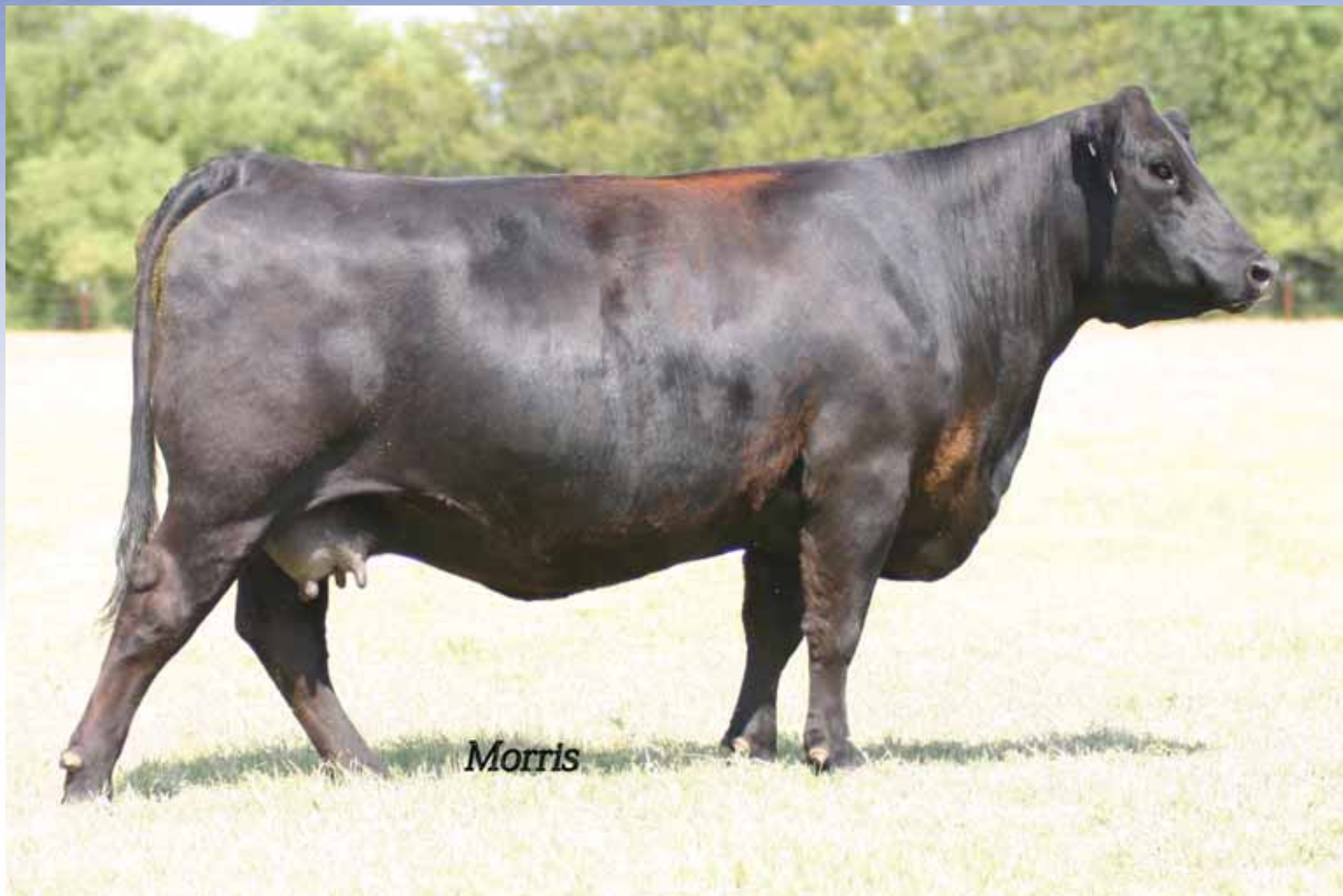
AUTO Lily 221U, Lot 6