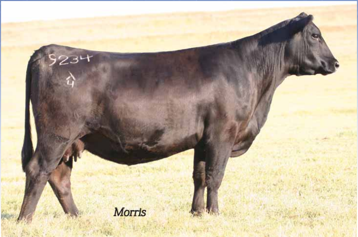
HCC 5682 Patsy Ann 9234, Lot 17