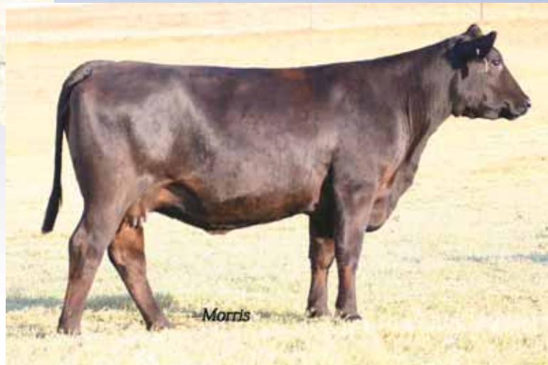
EXLR Luvly 037X, Lot 11