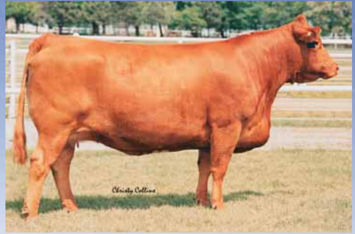
LVLS Rebeca, dam of Lot 18