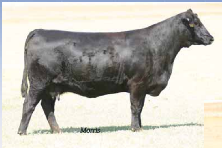
EXLR Radiant 028W, Lot 10