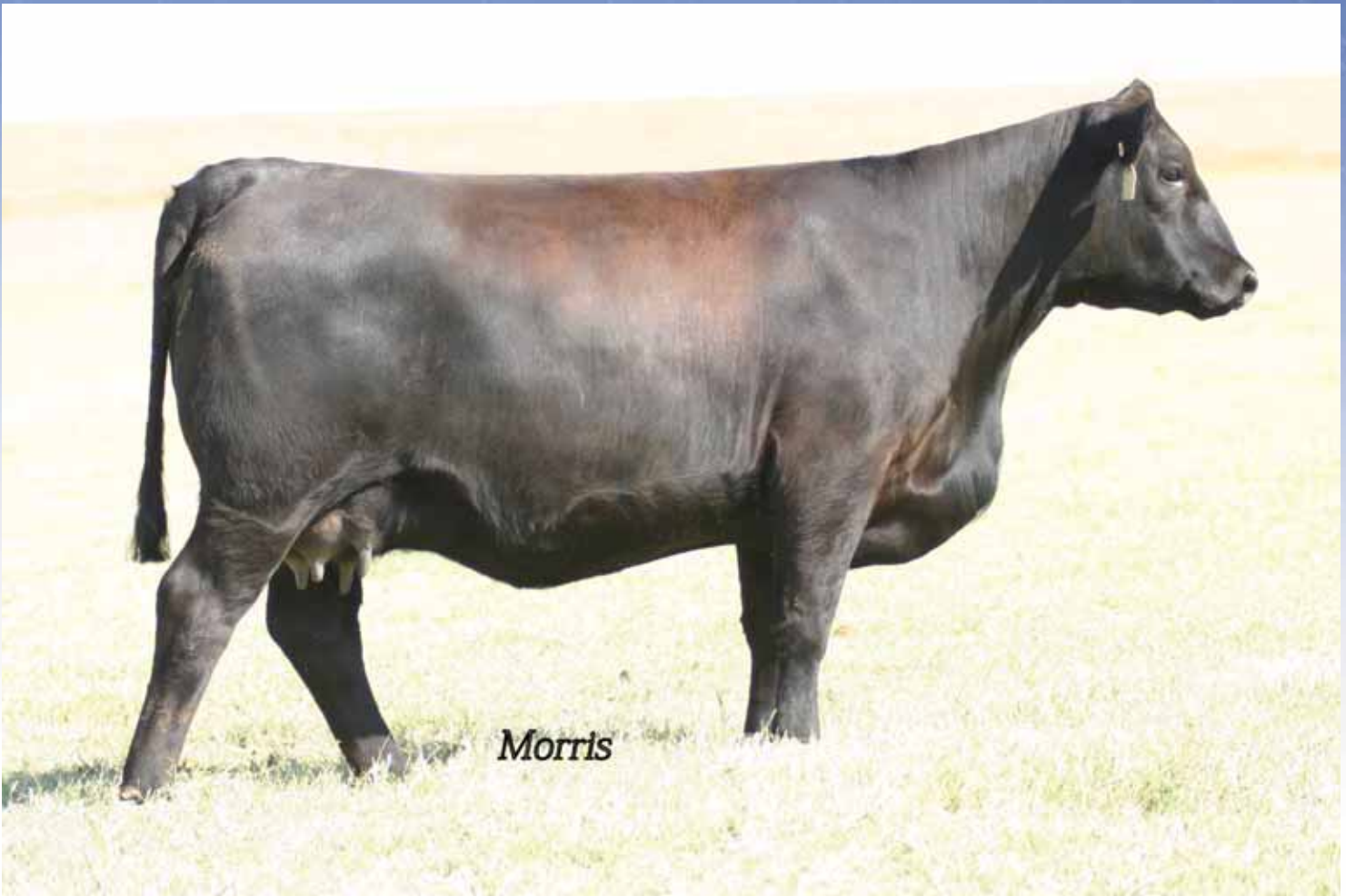
HCC Princess 0249, Lot 34