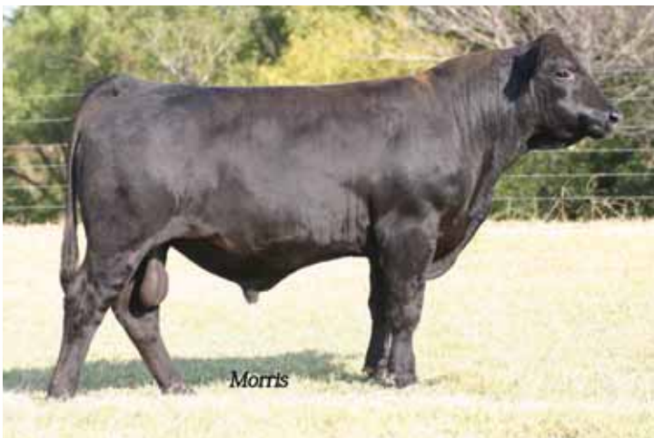
MAGS Willpower, sire of Lot 60 and 61.