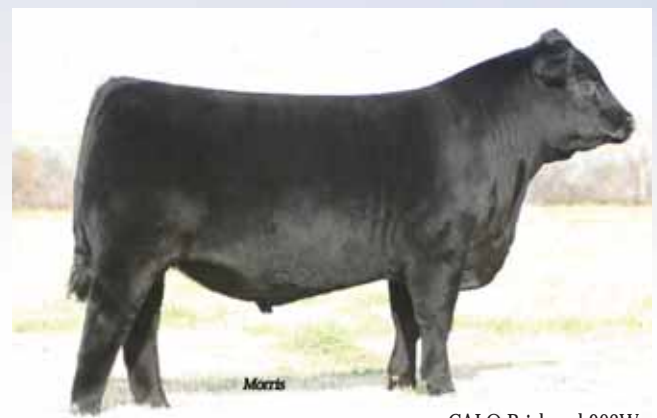
CALO Brickyard 902W