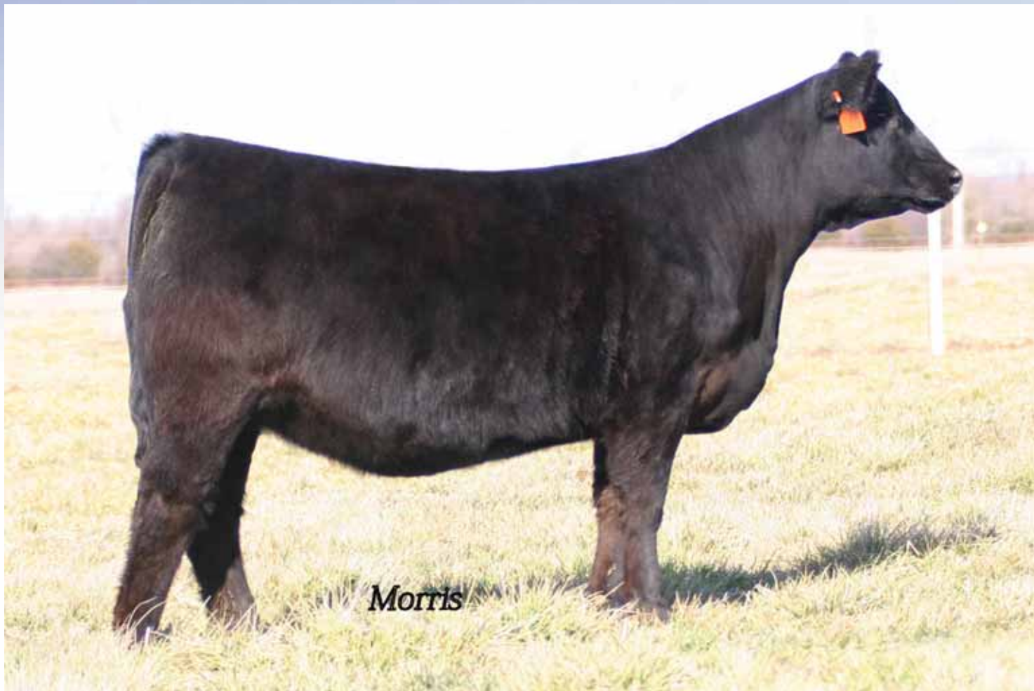
LVLS You Sure 9584Y, Lot 7