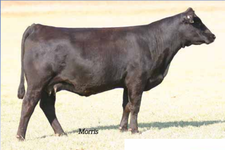
HCC 6501 Winsome Witch 02, Lot 32