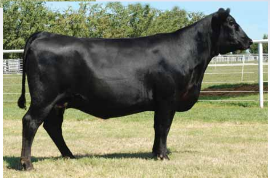
EXLR Barb 170R, dam of Lot 5 The Breed's #1 Marbling cow!