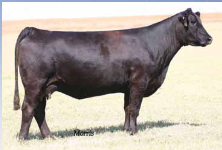
STSF What Up? 940W, Lot 25

AUTO AMERICAN IDOL 162L AUTO ROUGH IDLE 141J AUTO CAPT SPRINGFIELD351P WULFS DELIGHT 4114D AUTO BARBARA ANN 277H WULF'S COUNT DOWN 9251C AMBL LUVLY 340Y PAF E128 SI T460 EXAR SUDDEN IMPACT 1537 PAF T460 404 2 PAF 7684 DATELINE E128 PAF E104-C01 SI 404 EXAR SUDDEN IMPACT 1537 PAF 1472 PR E104