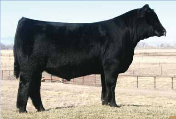
MAGS Xukalani 691X