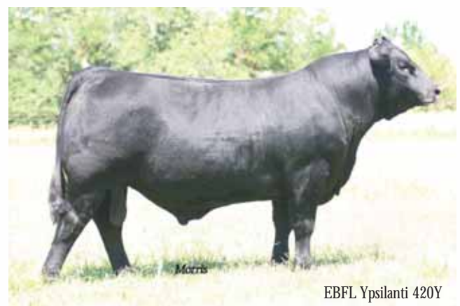
EBFL Ypsilanti 420Y