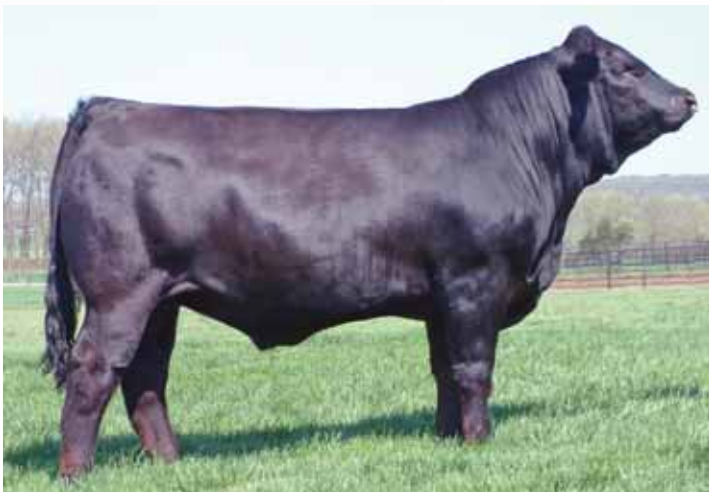
AUTO Capt Springfield 351P, sire to Lots 22, 23 and 24