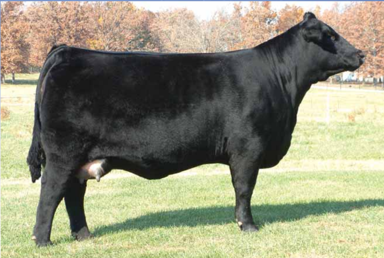
AUTO Rebeca 292S, dam of Lot 15