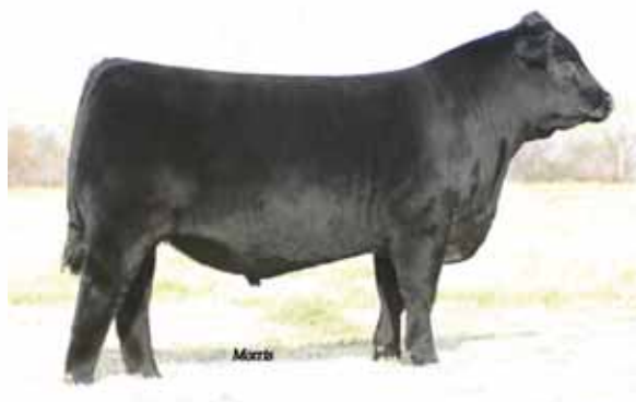
CALO Brickyard 902W, sire of Lot 3